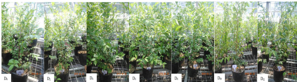
Fig. 1. Ulmus szechuanica seedlings under different drought conditions.

For drought stress treatments, seven water gradients (D 0 , D 2 , D 4 , D 6 , D 8 , D 10 , D 12 ) were prepared. D 2 represents that seedlings were irrigated after two days drying. Single factor test design, 2 d as a treatment period, that was every 2 d, one treatment stopped watering, Other normal watering. To 25 June, 7 water gradients were formed: D 0 (CK), D 2 , D 4 , D 6 , D 8 , D 10 , D 12 , which represent a drought treatment for 0, 2, 4, 6, 8, 10 and 12 d, respectively. There were 30 replicates per treatment (Fig. 1).